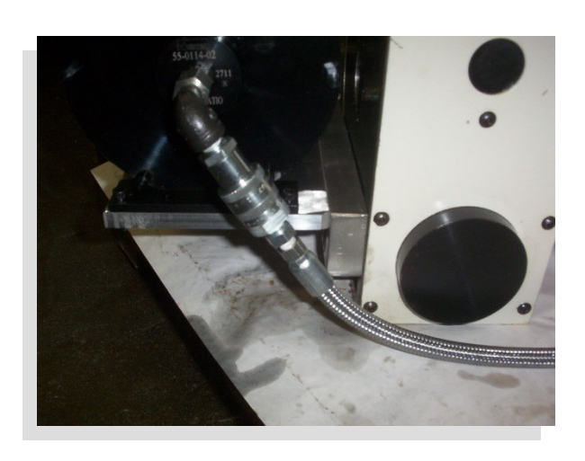
9. Connect quick coupler to output side of pump