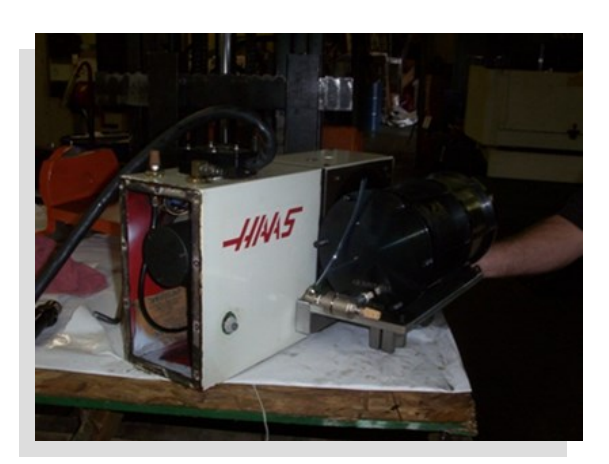
7. Connect 1/4" hose from air inlet port side (as shown on back of cylinder)