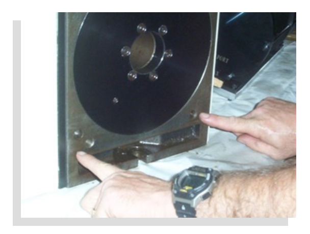
6. Mount pump to back of indexer using (2) cap screws (provided)