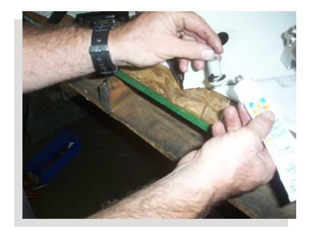
5. Insert bulkhead fitting (provided). Spread permatex around inside of flange on both sides (permatex provided)