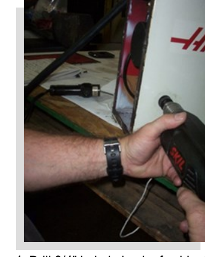
4. Drill 3/4" hole in back of cabinet with metal hole saw approximately 2" from end and 3 1/4" from bottom of cabinet