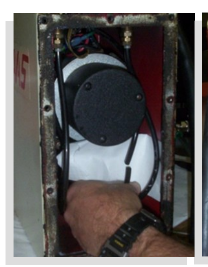
3. Cut this hose in half as close to the opening of the box as possible and attach quick disconnect "T" (provided)