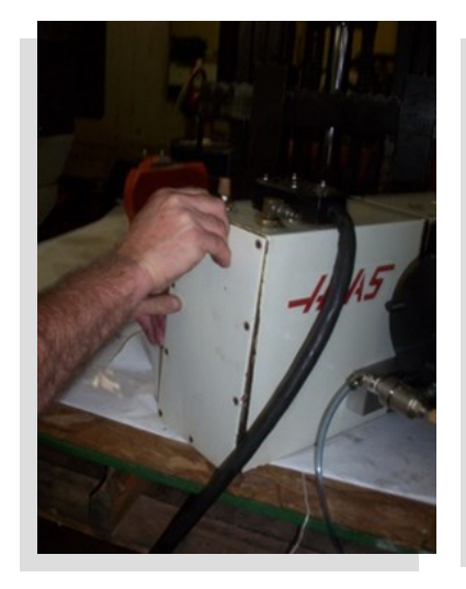
1. Remove Cover